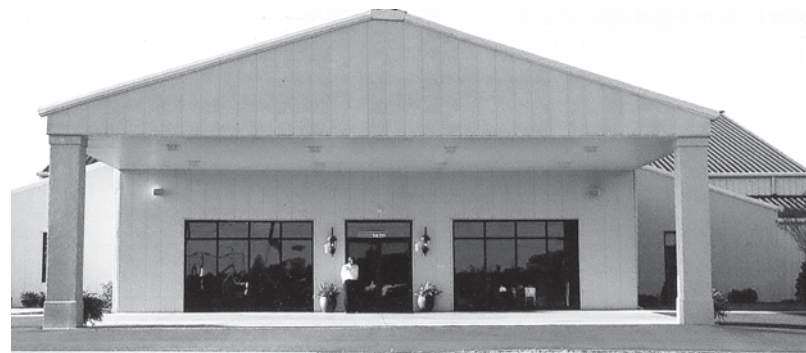
Allen S. and Norma T. McLaughlin Family Life Center