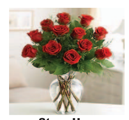
Store Hours Monday, Tuesday, Thursday & Friday 9am to 5pm