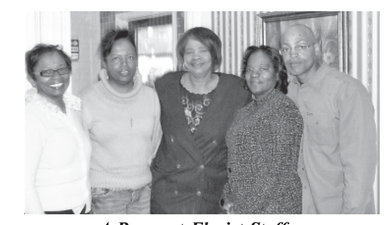
A Bouquet Florist Staff

Call Now To Placed Your Easter Orders (910) 488-2312