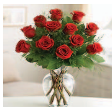
10% OFF With This AD!

Located in the old Tucker Florist's Next to Suburban Mart * (910) 488-2312 "We do fresh & silk flower for all occasions" 2112 Murchison Road * Fayetteville, NC 28301