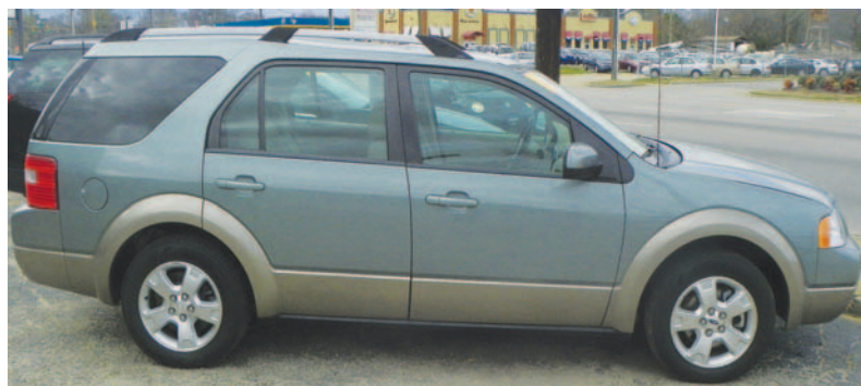
2007 Ford Freestyle SEL 4D Loaded * Green

534 Grove Street * Fayetteville, NC 28301 Priced to Sell Now - Call Dave (910) 480-9470 * Ride In- Ride Out