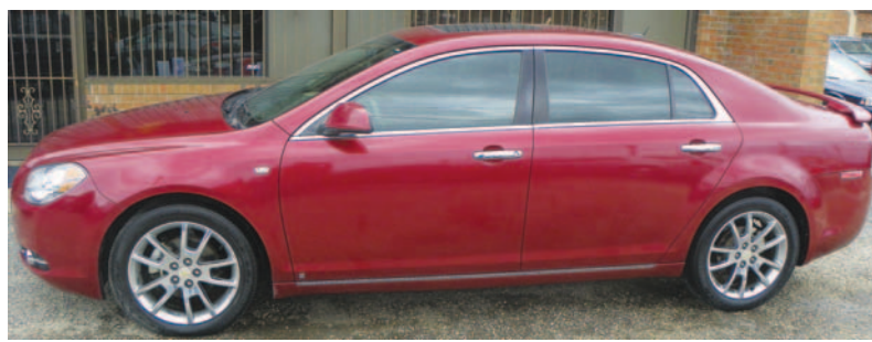
2008 Chevy Malibu LTZ Burgundy * Loaded * Leather