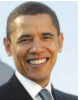
Barack Obama President of The USA