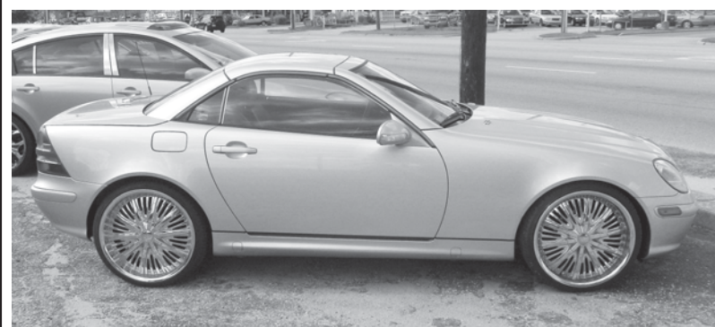
2001 Mercedes SLK 320 * Loaded * Good Miles Silver * Hard Top Convertible

534 Grove Street * Fayetteville, NC 28301 Priced to Sell Now - Call Dave (910) 480-9470 * Ride In- Ride Out