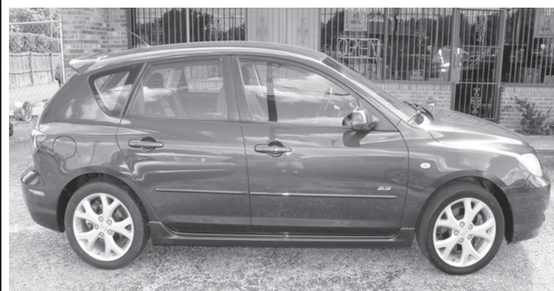
2007 Mazda 3 * Loaded * Blue * Good Miles