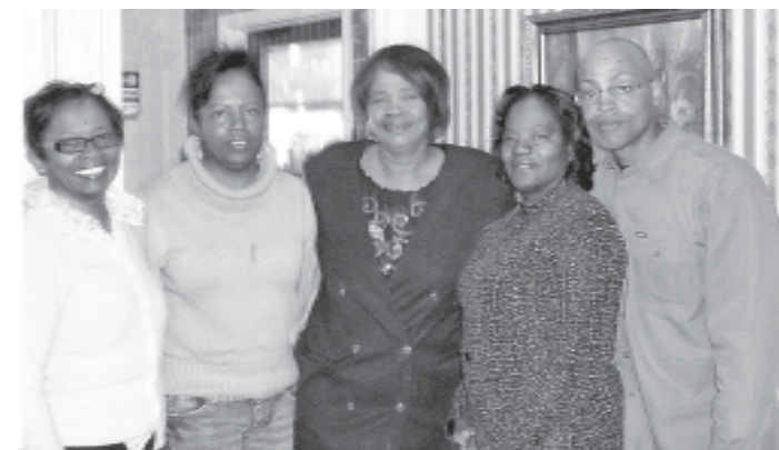
A Bouquet Florist Staff

Call Now To Placed Your Holiday Orders Now (910) 488-2312